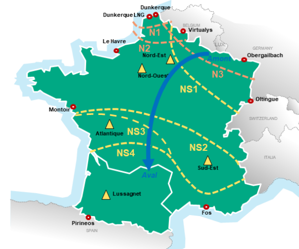
Cartes des limites Scénario Sud vers Nord Avec travaux